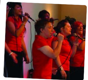
Living Hope on Tour

"I know that everyone who came along was powerfully impacted through the ministry of the group. There was a tangible anointing on the songs & testimonies shared that really ministered to all who heard: no-one can have left that night remaining untouched! It was so clear that they carried within them the hope of the Gospel & their lives clearly manifested Jesus!"