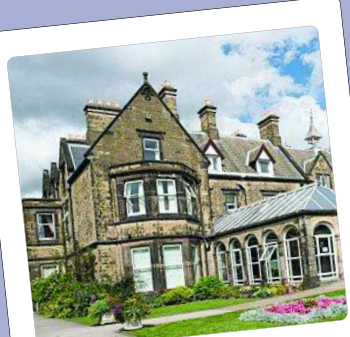
Hayes conference centre